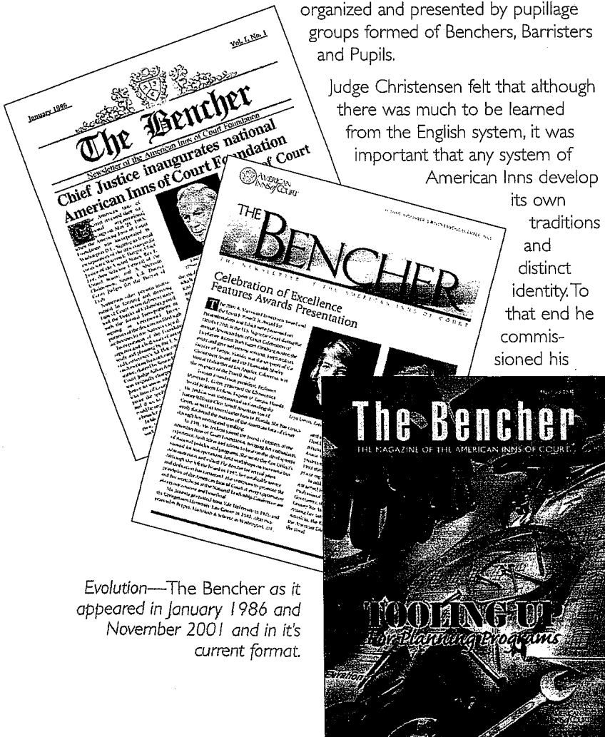
Evolution—The Bencher as it appeared in January 1986 and November 2001 and in its current format.